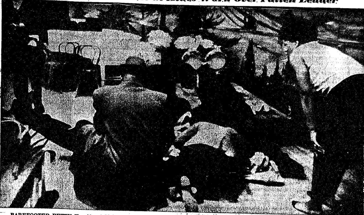
BAREFOOTED BETTY X, wife of Malcolm X, watches as his followers offer futile mouth-to-mouth resuscitation to husband as he lies mortally wounded on stage in Audubon Ballroom after being felled Sunday by a hail of bullets fired at close range as he stood on stage to address about 500 of his militant followers.