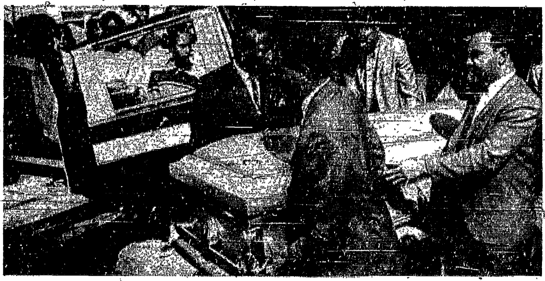
DR. MARTIN LUTHER KING, JR. COMES HOME

He had the common touch ... did this uncommon man. In the majesty of his death, he has left open a question which White America must answer ... a question which can no longer be ignored! Where does America go from here? White America was forced to give a partial answer at Montgomery! White America reluctantly admitted knowledge of the "problem" when Martin Luther King delivered this unforgettable "I Have A Dream" speech in Washington, D. C. in 1963. A record crowd of 250,000 people of all races and creeds and all faiths gathered in our Nation's Capitol. They heard Dr. King, the grandson of a slave, blueprint the course America must follow, on that memorable day. From Montgomery to Memphis! Not too far in this era of modern transportation. But in terms of living, it practically covered the adult life-span of Martin Luther King. That is the book. The chapters illuminate a faith so unyielding, a philosophy so impregnable; an humanitarian concept so divine, that its motive can never be questioned. As we go to press, America's conscience is suffering the pangs of the damned. Our President has cancelled the most important foreign trip of his turbulent career. Millions ... yes, millions of white Americans ... have had their first lessons in Negro history. Today, millions of white people at least can say they know something about THEIR problem. Schools across our nation have closed; flags are at half-mast; memorial services are being held around the world.