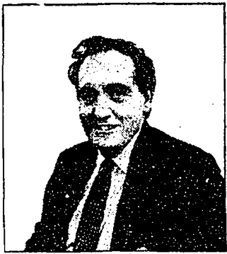
Clive Barnes, covering in detail the burgeoning black theater, its actors, playwrights and audiences.