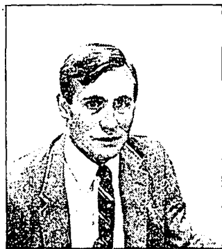
Edward B. Fiske, reporting on the influence of black power on the nation's churches.