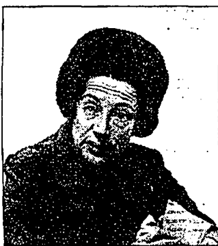
Grace Glueck, on the arts scene, to help you understand the increasing importance of black artists.