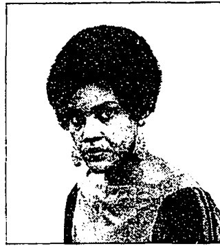
Charlayne Hunter, one of the first black students at the University of Georgia, who returned to report on the changes there.