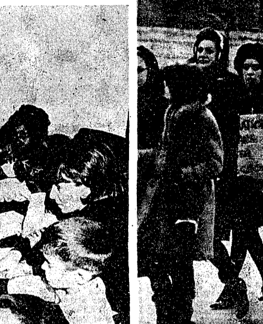
"WE SHALL OVERCOME" — Unidentified minister, wearing knitted Navy cap beneath his hat to keep his head and ears warm during Monday's chilling weather, marches silently alongside chanting youths outside of City Hall.