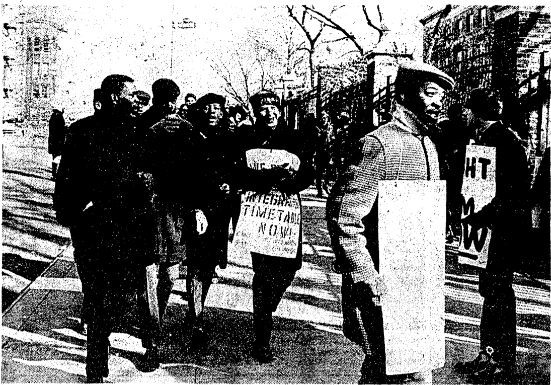
TOGETHERNESS — Students of George Washington High School paraded in the bitter cold in protest against segregated schools in New York City. The line at one time numbered more than 100 parents, teachers and students.