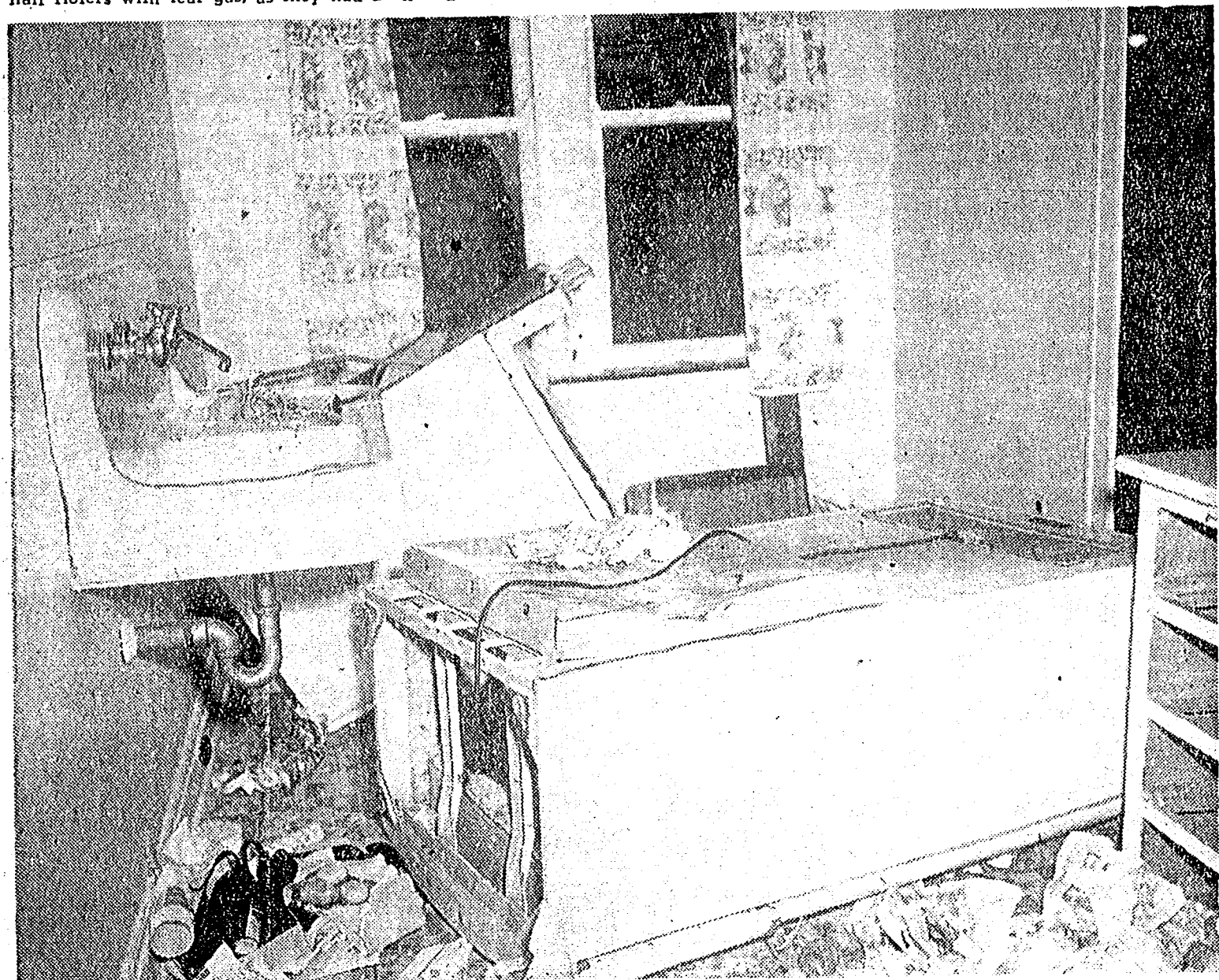
WINDOWS WERE SMASHED and the stove and refrigerator overturned (photo at left) as mob violence reached its peak. The Clarks and their two children had left the building Tues-