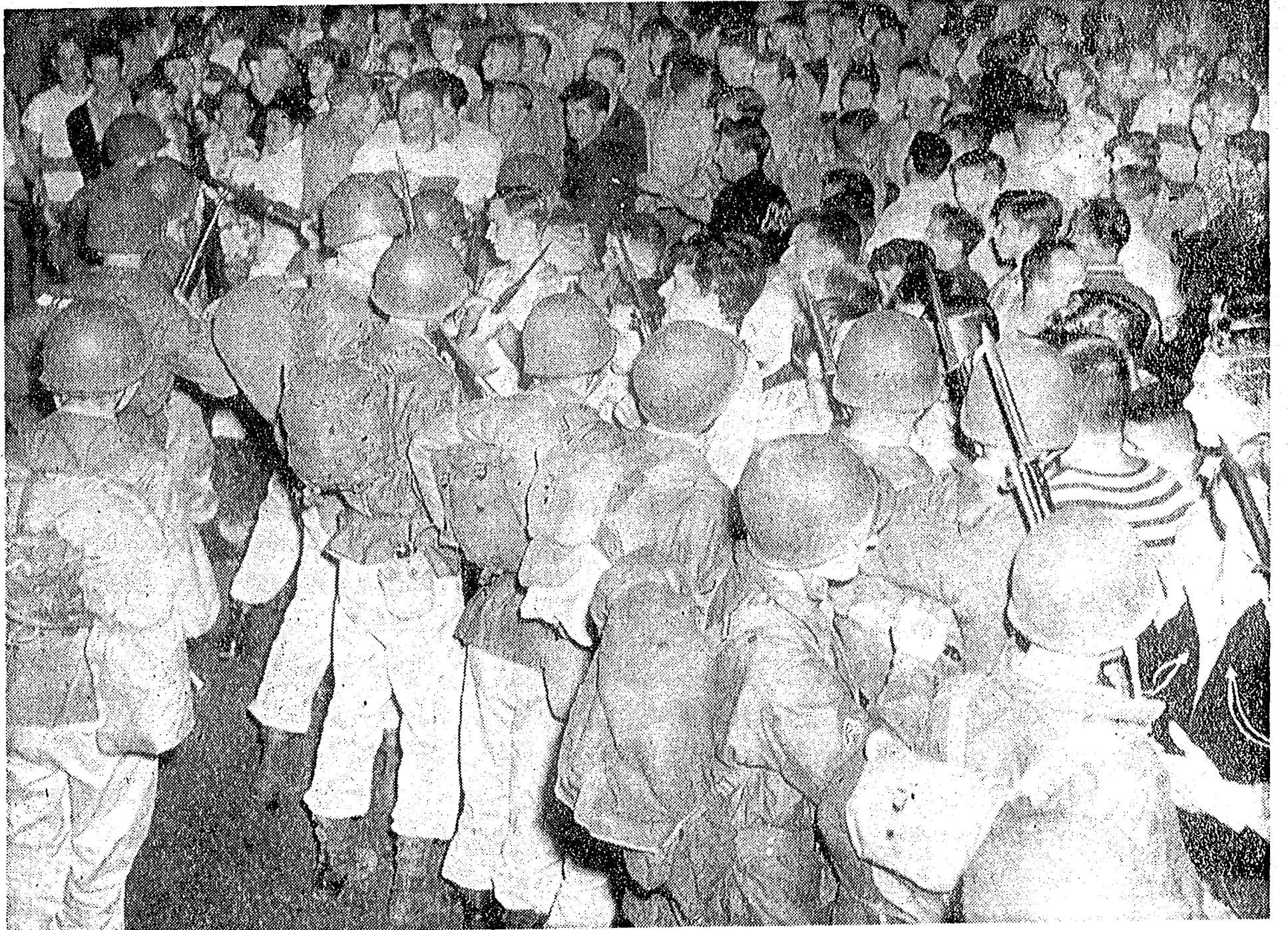
SOLDIERS STAND shoulder to shoulder in an effort to hold mob at bay during rioting described as "worst in Chicago in years." When Cicero and County police failed to quell disturbance, 500 National Guardsmen were called out. They were greeted with jeers and bricks from the onlookers.