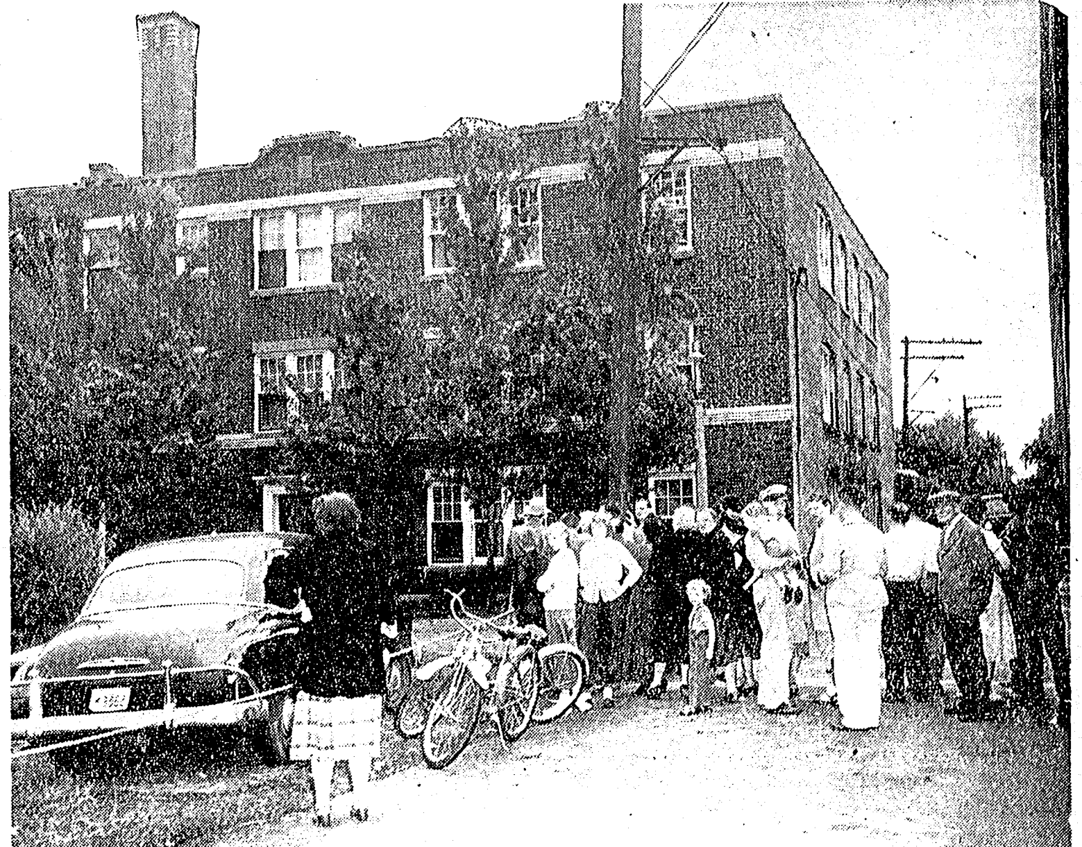
day in fear of the crowds that began to gather. Furniture, rugs and clothing were tossed from the apartment as police, both local and county stood by and watched and did nothing. In photo at right, curious bystanders, some of them with children, stand around and talk in hushed whispers while waiting for night to fall and the rioting to begin. Building where Clarks rented apartment is in background.