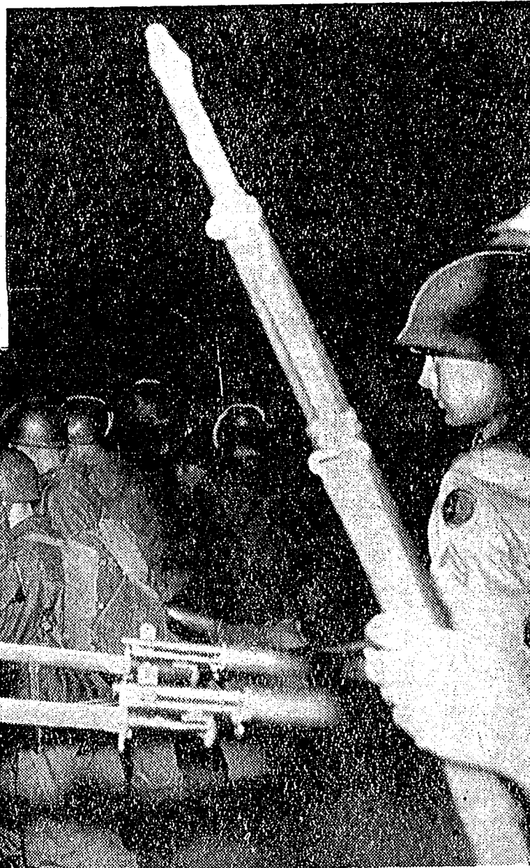
BAYONETS IN PLACE soldiers attempt to halt rioters with tear gas, as they had been told not to fire unless ordered to by their commander. Order succeeded in establishing an out-of-bounds area around the building.