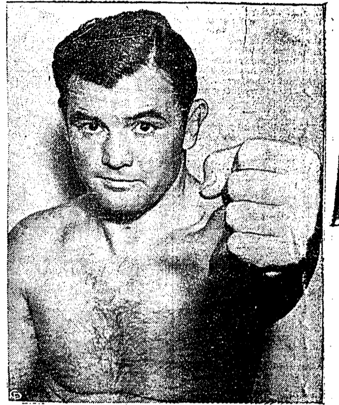
JAMES J. BRADDOCK

CHICAGO—(SNS)—A bold, courageous champion went down gloriously in defeat Tuesday night as 50,000 wild-eyed fans went primitive watching the bloody carnage of James J. Braddock by the bludgeoning right and left fists of Joe Louis, the sensational Detroit Brown Bomber. After an early knockdown of the Bomber, Jim was never in full command of the fight again and went down to stay after one minute and ten seconds of the eighth round.